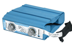
Wedge & Wedgekit